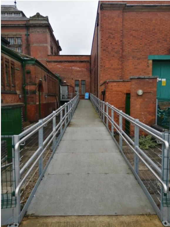
Switch Room Ramped access