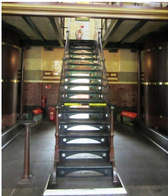
Stairs to Upper Floors

There are audio visual displays in the Lower Beam Engine House which have BSL but no subtitles