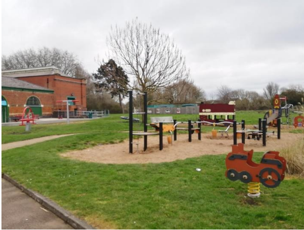
Abbey Pumping Play Area